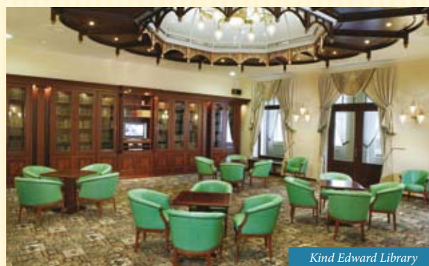
Kind Edward Library