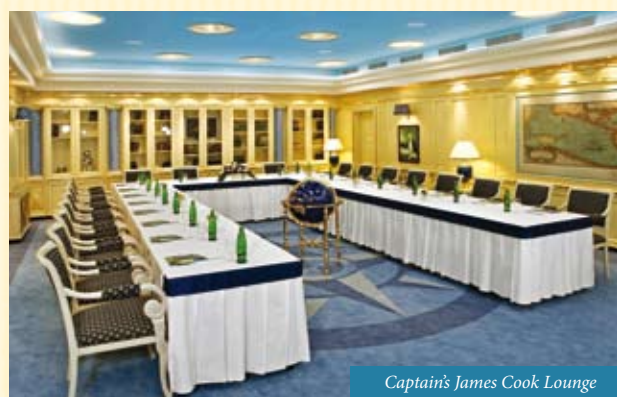
Captain's James Cook Lounge