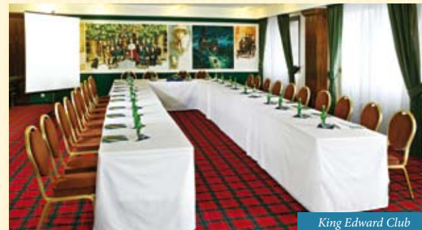
King Edward Club